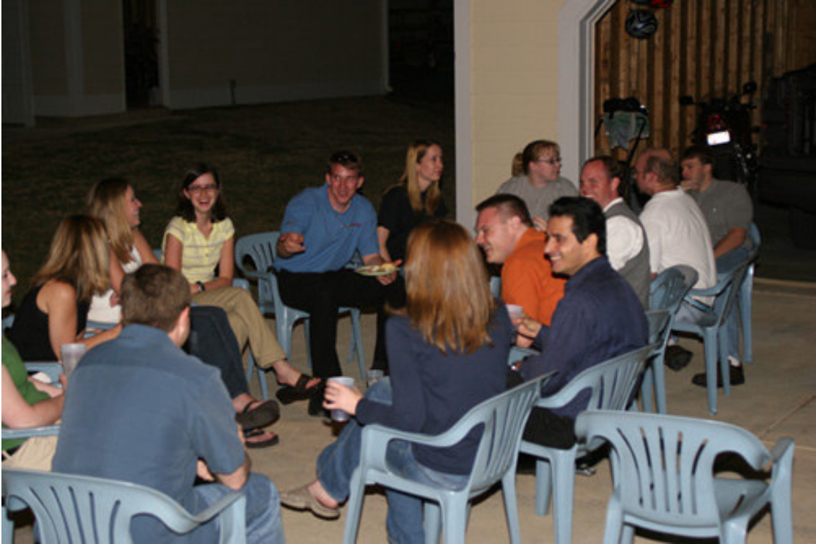
Illustration D.16 Almost every megachurch has an extensive infrastructure of small groups. They typically meet two to four times a month in home or office settings, and typically include times of fellowship, prayer and Bible study. The groups occasionally do service projects together. The main focus is to care for one to another. The group leader is often trained by a church staff member, or by another group leader who in turn, is coached by a church staff member.