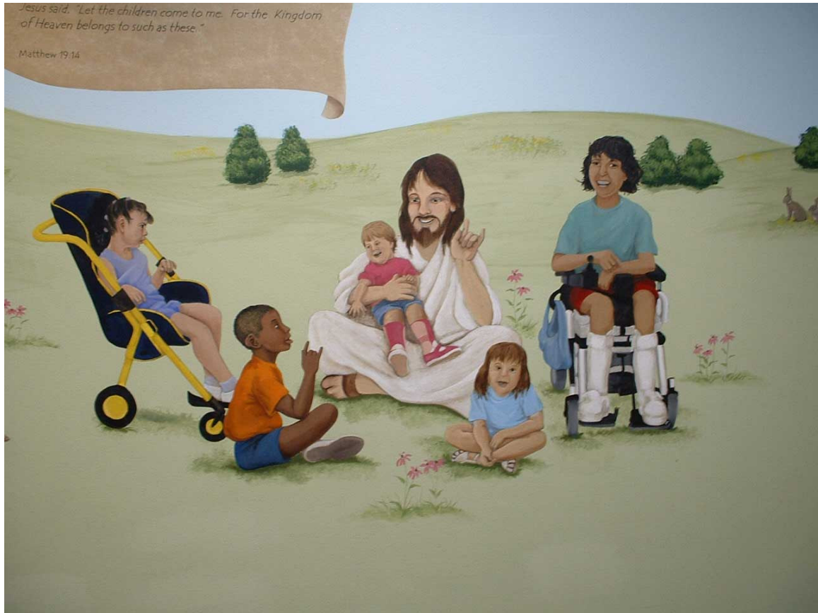
Illustration D.13 McLean Bible Church , a non-denominational church in McLean, Virginia, sponsors a major program for children with mental and physical handicaps. Similar to all other church programs, it is staffed largely by volunteers and funded by donations. Larger churches typically have more ability than smaller churches to offer niche programs that require extensive equipment or a large group of highly specialized volunteers.