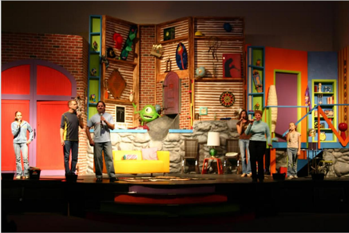
Illustration D.14 Almost all growing megachurches have thriving children's and youth ministries. North Point Community Church , north of Atlanta, pioneered an approach that helps families grow together spiritually. For example, a very popular weekly small-theater presentation at the church limits attendance to those who come as a parent-child unit. In other programs, a child can participate only if a parent regularly volunteers in it.