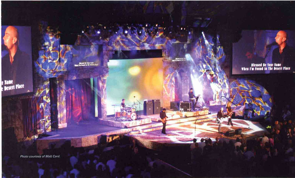
Illustration D.4 Megachurches often generate a strong word-of-mouth reputation for the high quality level of their worship services. Fellowship Church , just north of Dallas, is a Southern Baptist congregation that started in 1989 with 30 families and in 2006 was drawing 20,000 people each weekend. It spends 42% of its budget on staff and depends on 1,300 volunteers to develop the worship services and support programs needed each weekend.