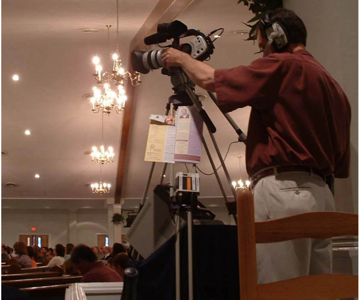
Illustration D.7 Many megachurches use video technology, but most limit it to in-house purposes such as making copies of the service for members who missed, to give away in outreach, and to play live on TV monitors in “cry rooms” for parents with needy infants. A few broadcast on local television, and fewer nationally. As most programs in megachurches, it may be headed by paid staff but volunteers fill the majority of roles.