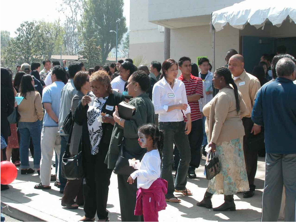
Illustration D.15 Megachurches tend to be more multi-ethnic than their smaller counterparts. New Song Church, Irvine, California , has senior staff who are of Asian, African, and Caucasian backgrounds, and the congregation is likewise racially mixed—15 different races on a typical weekend. The church meets in a converted warehouse for its original campus and in a rented school for its second campus. It is part of the Covenant Church denomination.