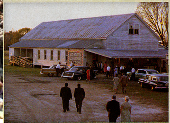
Illustration D.1 Lakewood Church is currently the largest-attendance church in the United States, with an average of more than 30,000 weekly. It meets in the Compaq Center, former home of the Houston Rockets basketball team. John Osteen, a former Southern Baptist, started it in 1959 in an abandoned feed store with 90 people. He died in 1999 and his son, Joel Osteen, became pastor. The church is charismatic and non-denominational.