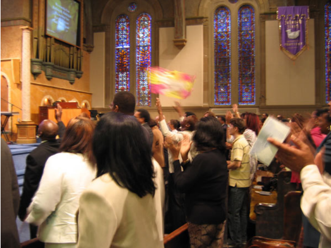
Illustration D.11 The average megachurch sanctuary seats 1,709 and uses multiple worship services—and often has conflicts with the local zoning board. Christ Church of Montclair, NJ , has 900 seats, runs four weekend services, and is locked in a three-year battle with a nearby township over expansion and relocation efforts (29 public hearings to date). Interestingly, this facility was built by a liberal church, the first parish pastored by Harry Emerson Fosdick who preached the widely circulated sermon, “Shall the Fundamentalists Win?” At this church facility, they did!