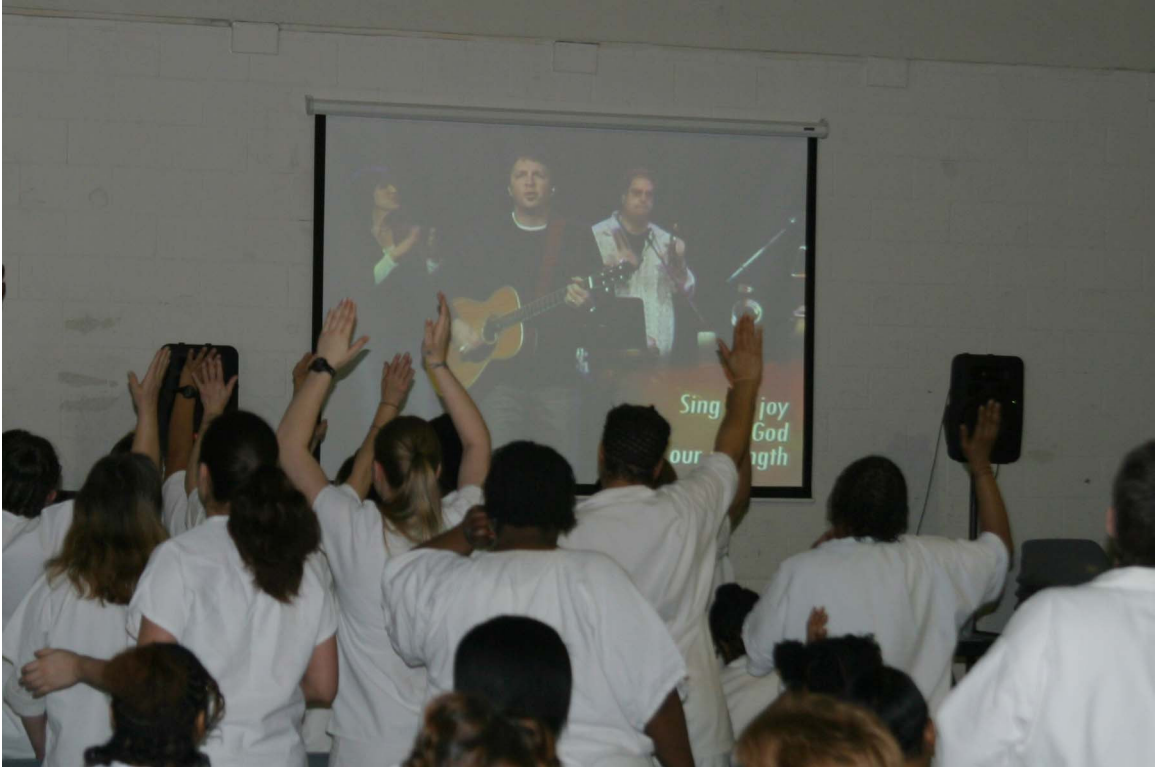
Illustration D.9 Lake Point Church , a Southern Baptist congregation in Rockwall, Texas, illustrates how one of four megachurches have spilled over to off-site campuses. It has two “full-service” campuses, housing ministries from children to adults. It also holds several niched worship services weekly, such as a cowboy service at a ranch or this correctional facility service on Sunday afternoons, using live music and a DVD of the morning’s sermon.