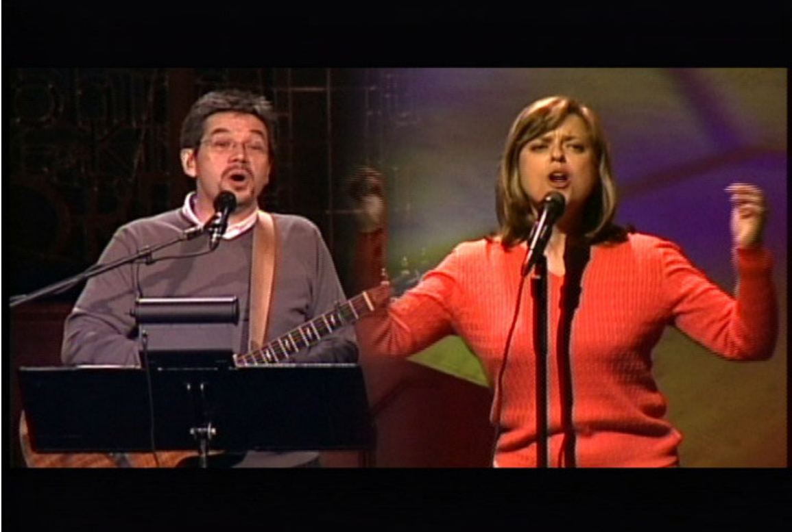
Illustration D.8 Northland Distributed Church , a nondenominational congregation in a suburb of Orlando, is technology-savvy like most megachurches. Their distinctive approach is for their various campuses to worship simultaneously. This means people seen on screen singing together are actually several miles apart. However, most megachurches that follow a multi-site approach have a campus pastor and live music local to each site.