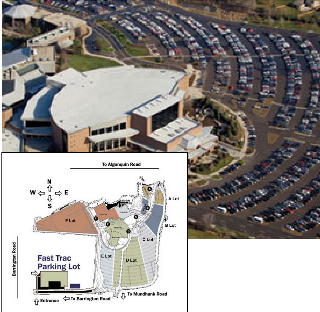
Illustration D.10 Willow Creek Community Church , in a western suburb of Chicago, popularized the “seeker” movement. They try to do church in a way that the message of the Gospel is as clear and relevant as possible. Their vision is “turning irreligious people into fully devoted followers of Christ.” A Harvard MBA program invited Willow Creek to present its model as a case study. A student concluded, “You want atheists to come and become missionaries!”