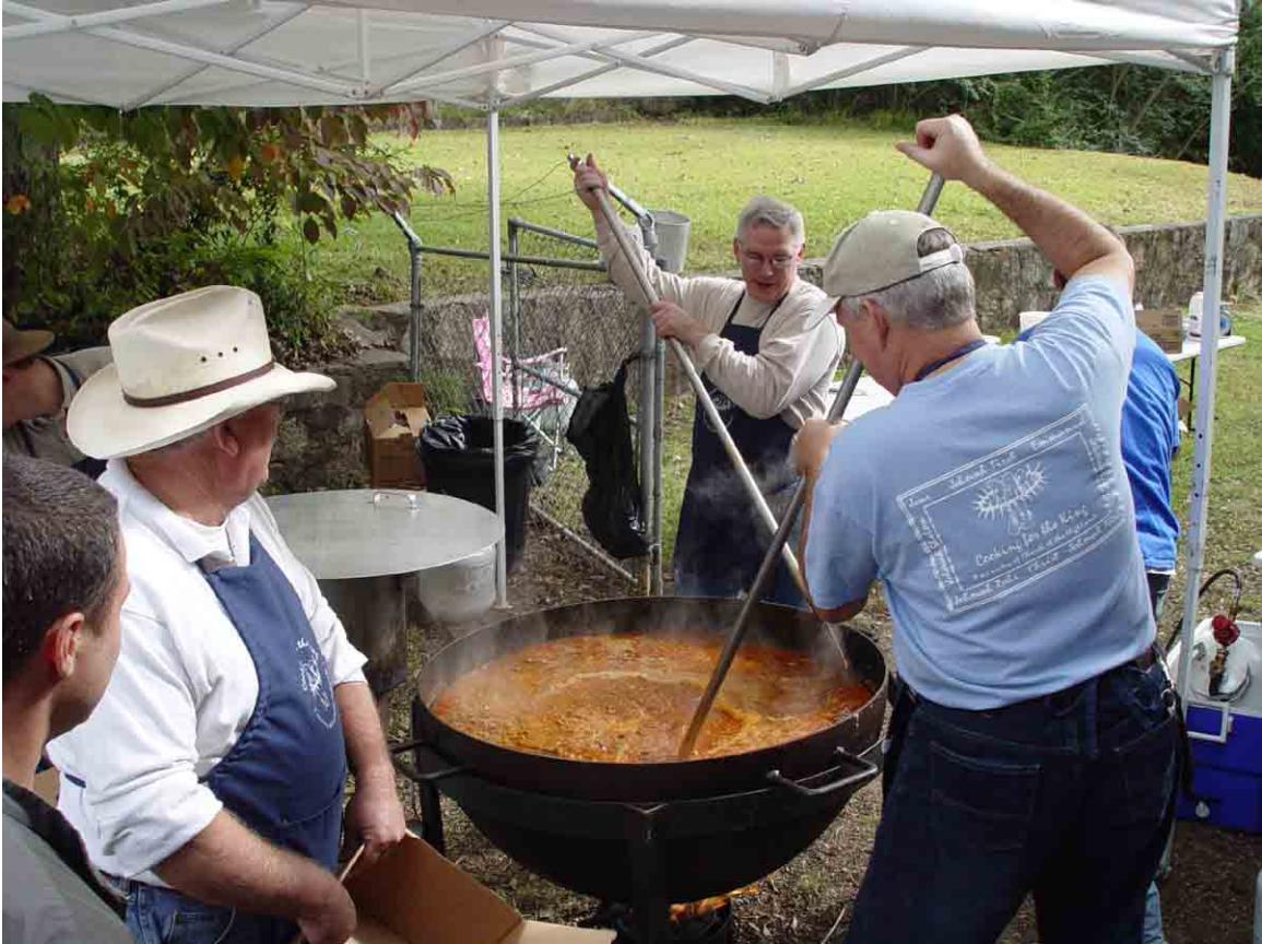
Illustration D.17 “Cooking for the King” is a small-group service team at Church of the Highlands , Birmingham, Alabama. The church draws 4,000 people to its weekly worship services, but has more than 4,000 people in a wide range of small groups, many of which are designed to represent Jesus as they serve their community.